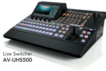
Live Switcher AV-UHS500

With this NDI I/F Unit attached, the Live Switcher AV-UHS500 supports input and output via the high quality, low latency video transmission of NDI®*1 and the stable, low bit rate transmission of NDI®|HX*1. This enables the construction of IP streaming systems covering operations from video transmission to camera control using a single LAN cable and supports remote live video production at sports and other event venues.